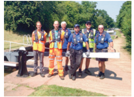
A job well done: the volunteers by the canal

The volunteers, many of whom have been Network Rail staff like