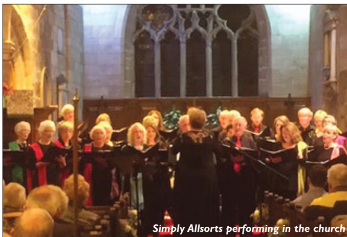
Simply Allsorts performing in the church

The audience who attended the ADAS Choral evening at St James' Church on Saturday 8th October enjoyed a variety of musical items performed by Crewe Brass and the Simply Allsorts Choir.